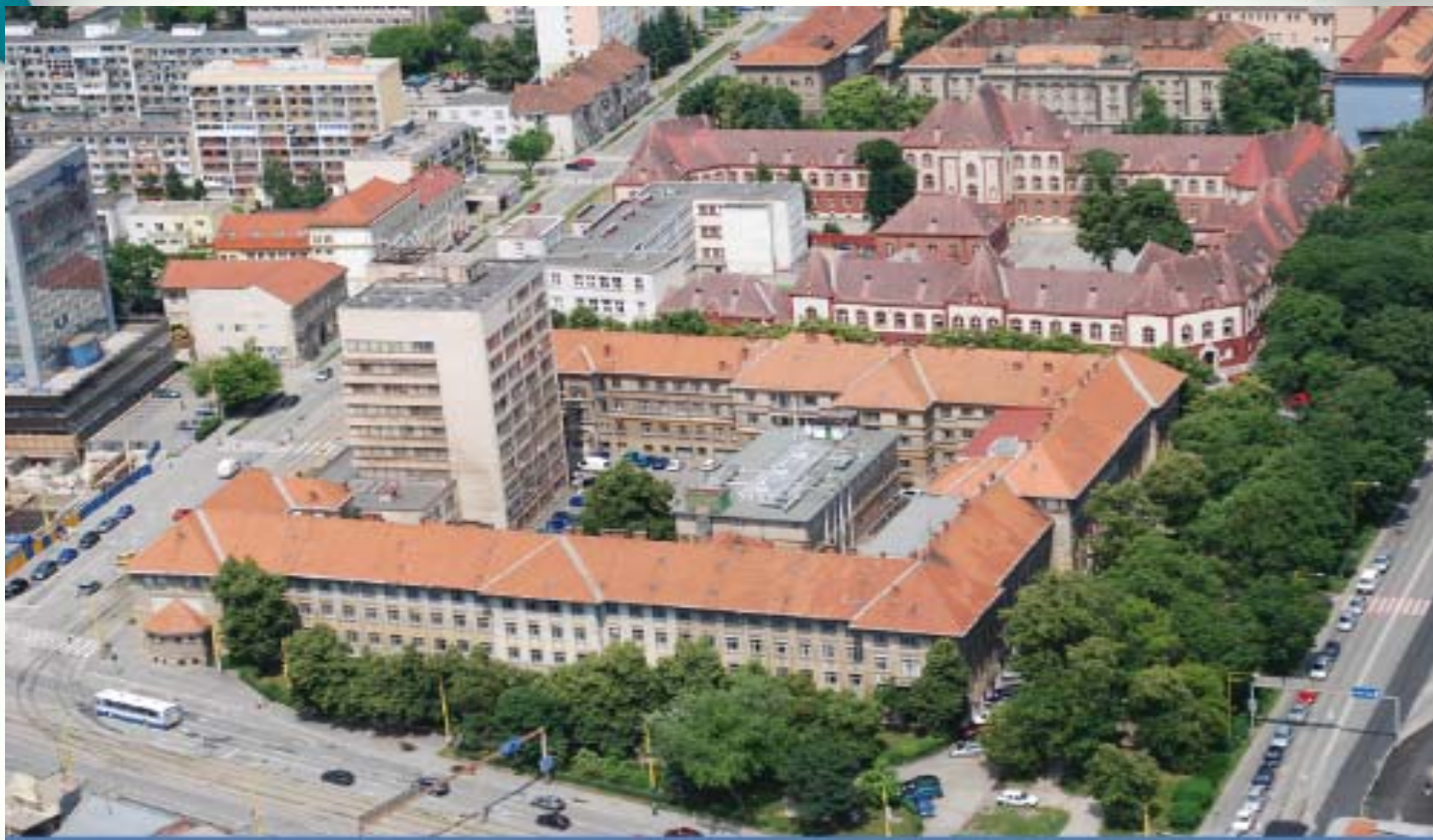
Regional Police Headquarters area