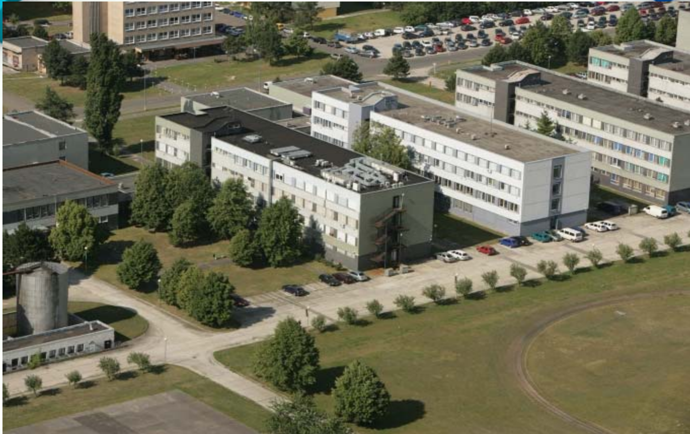
The Academy of the Police Force area