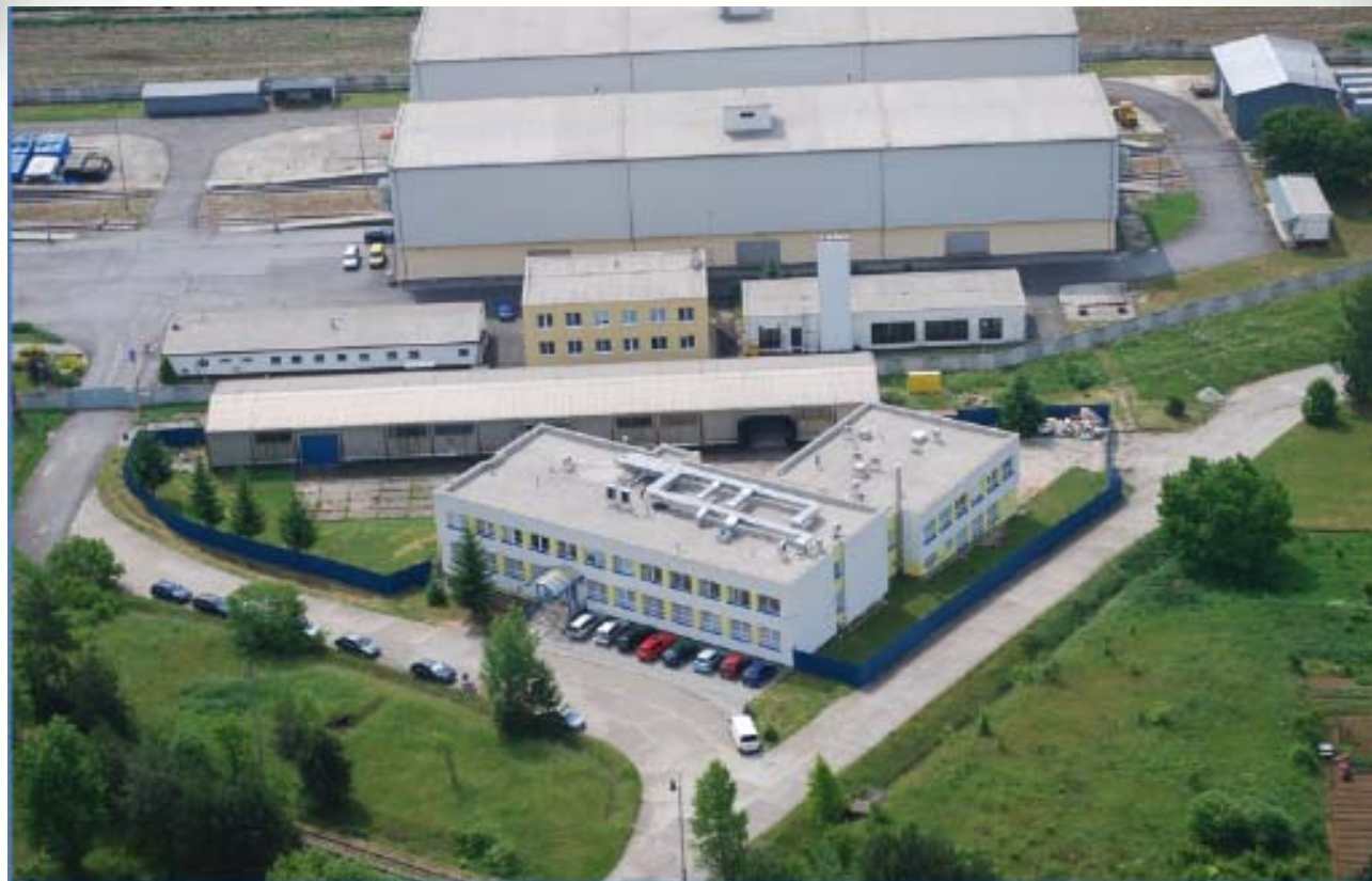
Stand alone area